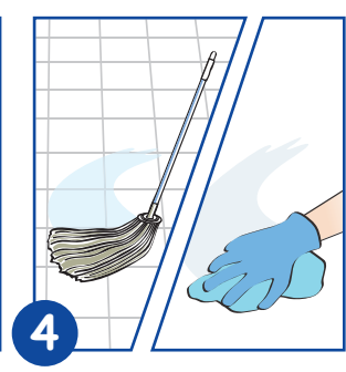
Damp mop floor or spray solution directly onto a cloth and clean the surface.