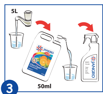
Dilute 50ml per 5 litres of water.