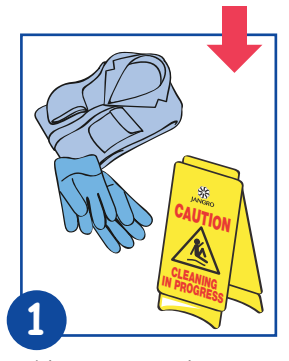
Use appropriate PPE as indicated in COSHH/REACH data and place safety signs.