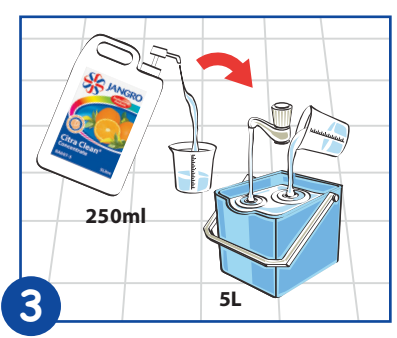
Dilute 250ml per 5 litres of water.